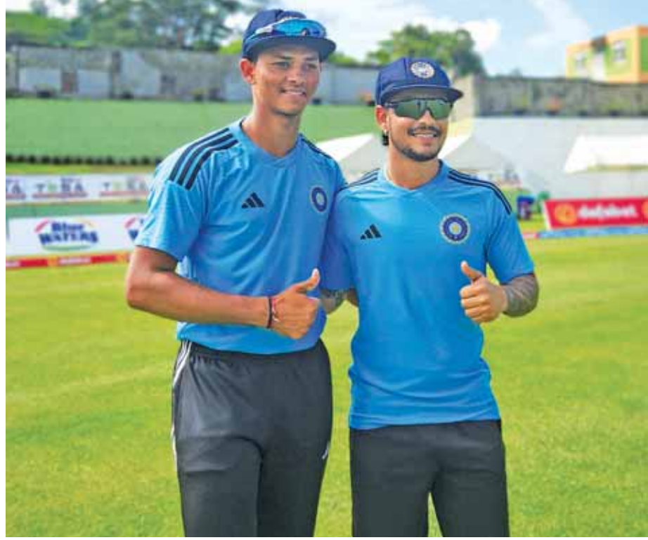
There was a nice loop and he did challenge both inside and outside edge during the second hour.

The pressure created by the pace duo did reap dividends as Ashwin (2/25 in 10 overs) slowed the pace of his deliveries, used the available drift to a good advantage to make life uncomfortable for the two openers.