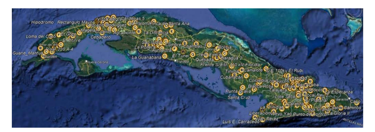
Figure 1: Snapshot of 175 sites spread across Cuba

In view of the importance of this project, the Government of Cuba has extended Sovereign Guarantee for developers/sellers who would be developing at least 250 MW capacity out of the total 1150 MW project. This Sovereign Guarantee shall cover payment realization for sale of electricity throughout the life of the project.