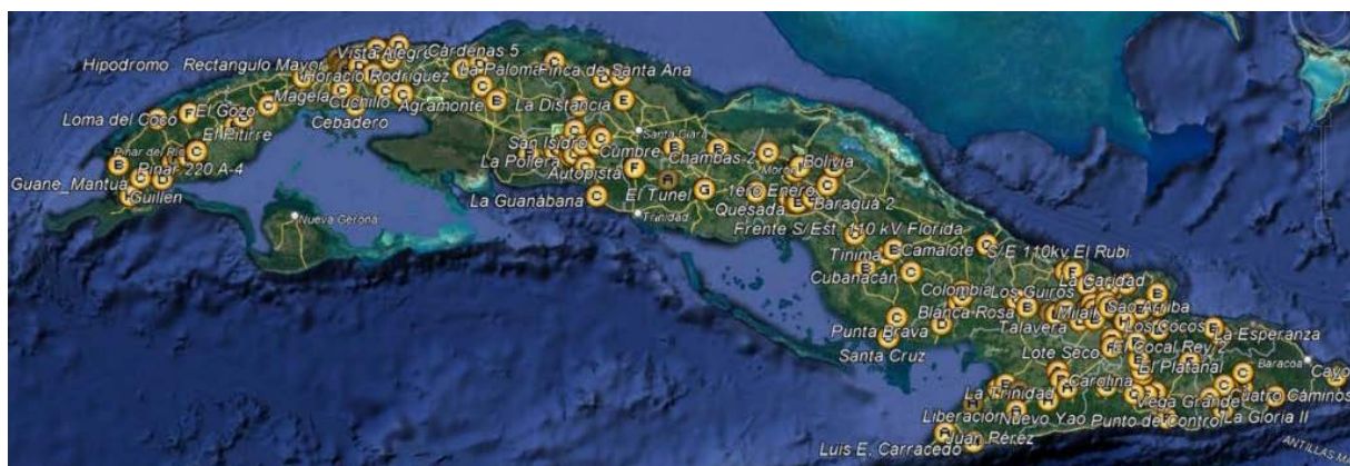
Figure 1: Snapshot of 175 sites spread across Cuba

In view of the importance of this project, the Government of Cuba has extended Sovereign Guarantee for developers/sellers who would be developing at least 250 MW capacity out of the total 1150 MW project. This Sovereign Guarantee shall cover payment realization for sale of electricity throughout the life of the project.